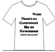
THE NO GOVERNMENT SHIRT - $20

Politically incorrect T-shirts with Libertarianz