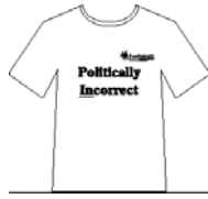
"P.I." T- SHIRTS - $20

Politically incorrect T-shirts with Libertarianz