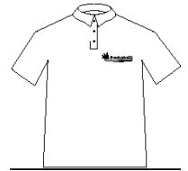
POLO SHIRT - $35

Cotton shirts in navy or white with button-down collar and Libertarianz